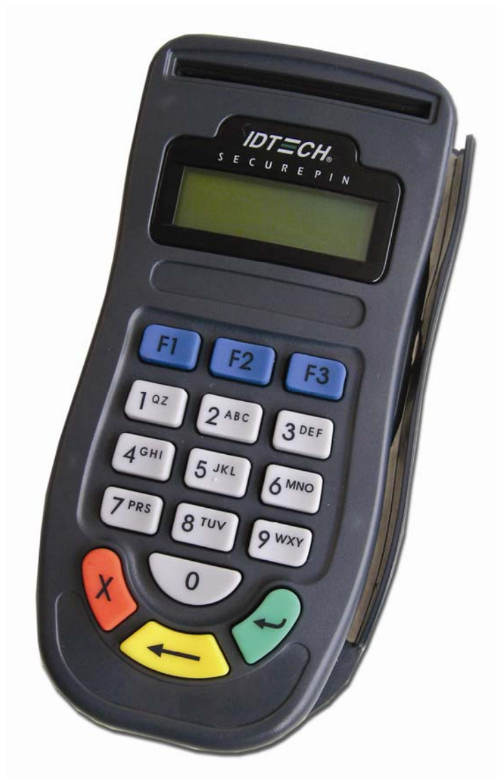
SecurePIN with Smart Card & MagStripe Readers